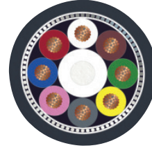
PUR halogen-free black shielded [PUR]