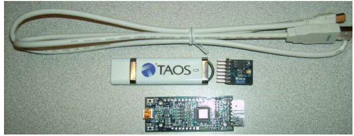
Figure 1: TCS3414 EVM Kit (shown)