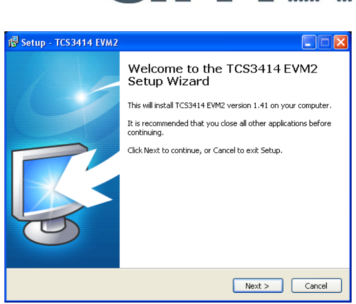
Figure 2: Welcome Screen

You may also use <u>http://www.ams.com</u> to find worldwide local representatives in your area.