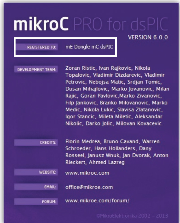
Figure 1-2: mikroC PRO for dsPIC® About Window