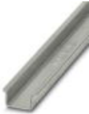
DIN rail, material: Steel, unperforated, height 15 mm, width 35 mm, length: 2 m

DIN rail - NS 35/15 UNPERF 2000MM - 1201714