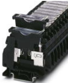
Fuse terminal block, cross section: 0.5 - 16 mm 2 , AWG: 18 - 8, width: 10.2 mm, color: blue

Please be informed that the data shown in this PDF Document is generated from our Online Catalog. Please find the complete data in the user's documentation. Our General Terms of Use for Downloads are valid ( http://download.phoenixcontact.com )